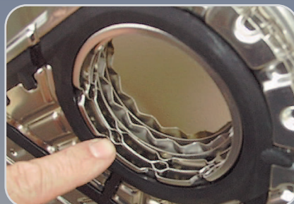
Improved Entrance Area